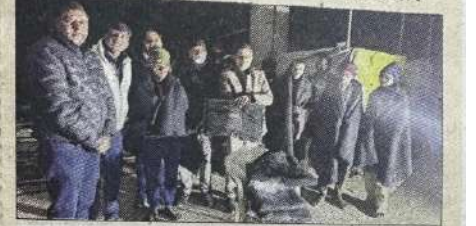
शिमला में जरूरतमंदों को कंबल बांटे रोटररी क्लब के सदस्य।