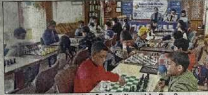
रोटररी टाउन हॉल में शतरंज प्रतियोगिता में भाग लेते प्रतिभागी।

शिमला। रोटररी क्लब शिमला की ओर से रविवार को रोटररी टाउन हॉल में शतरंज प्रतियोगिता आयोजित की गई। इसमें शहर के विभिन्न इलाकों के 30 विद्यार्थियों ने भाग लिया।